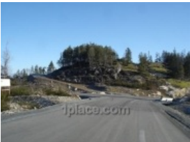
Lot 5 as viewed from Goldstream Heights Drive

SOLD Lot/acreage For Sale Lot 5 Finlayson View Place, malahat, BC, Canada