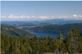
Finlayson Arm view